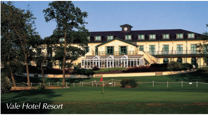
Vale Hotel Resort